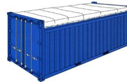
20' Open Top