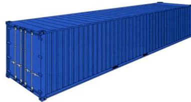
40' Standard or Dry Unit