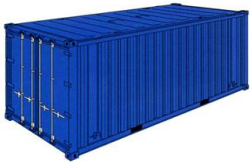
20' Standard or Dry Unit