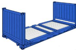
20' Collapsible Flat Rack